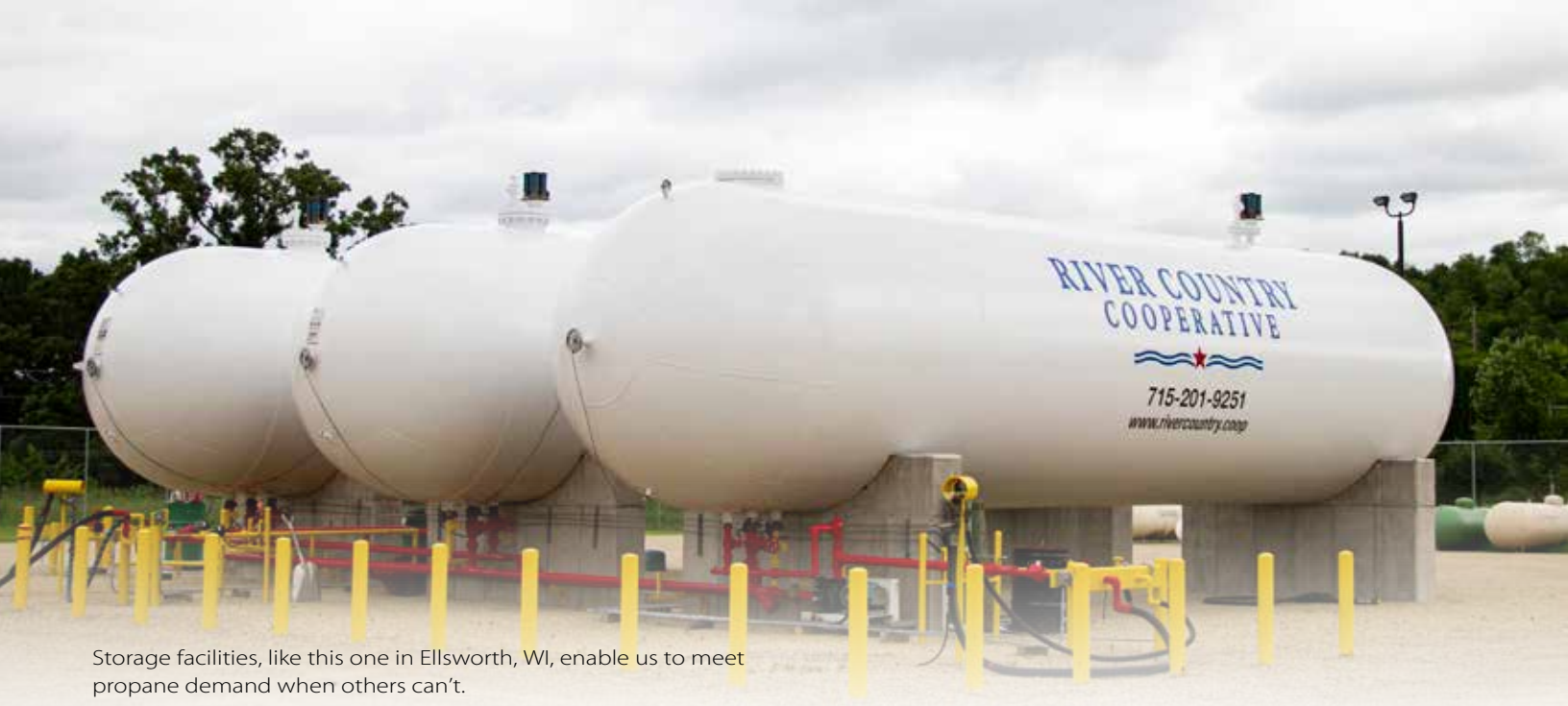
Storage facilities, like this one in Ellsworth, WI, enable us to meet propane demand when others can't.